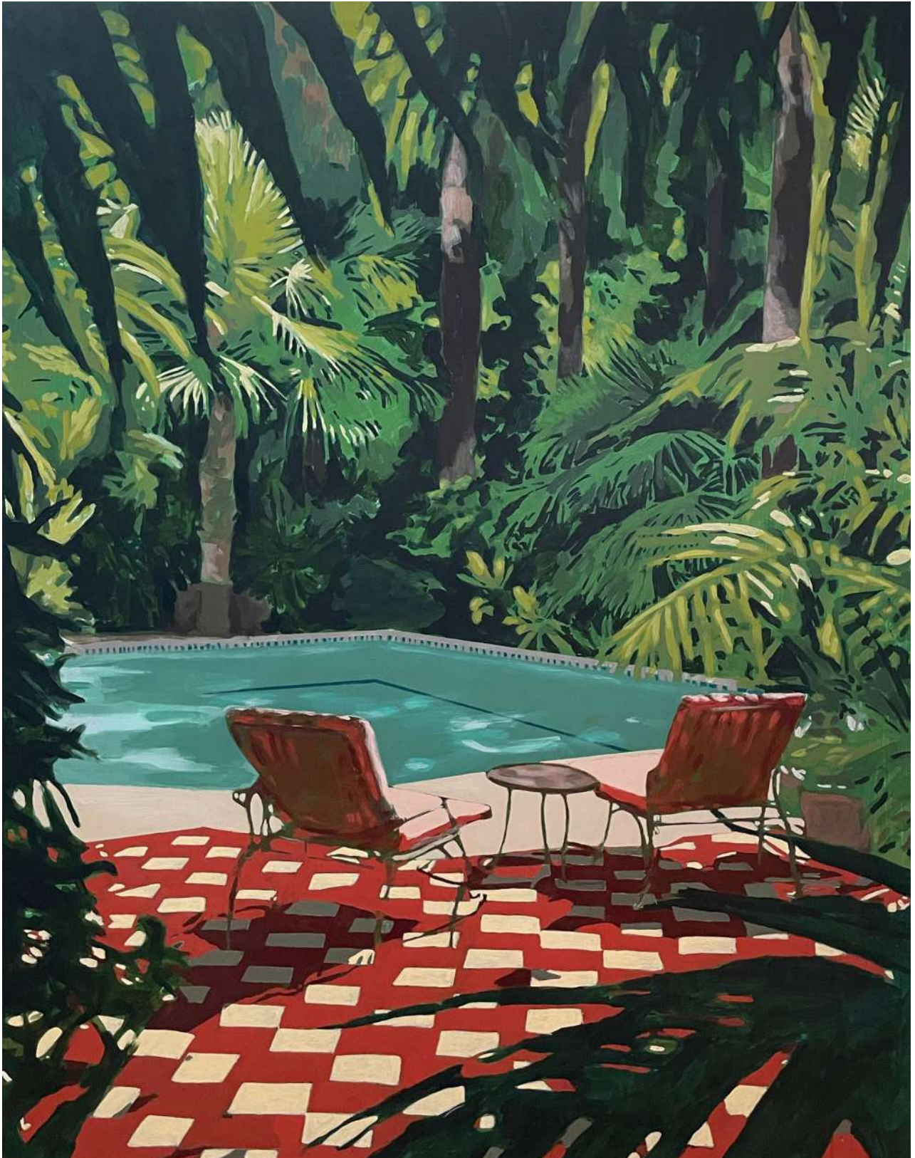
Untitled, 2025 Acrylic on wood panel, 90 x 75 cm