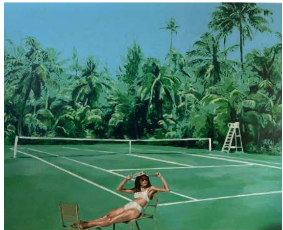
Up: Untitled , 2023, acrylic on wood panel, 130 x 127 cm Down: Untitled , 2024, acrylic on wood panel, 106 x 135 cm (left) / Untitled , 2024, acrylic on wood panel, 140 x 170 cm