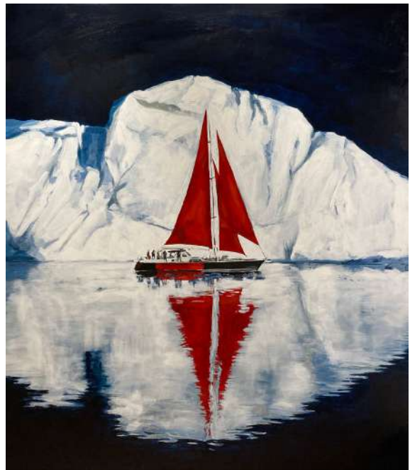
Untitled, 2025 Acrylic on wood panel, 150 x 130 cm