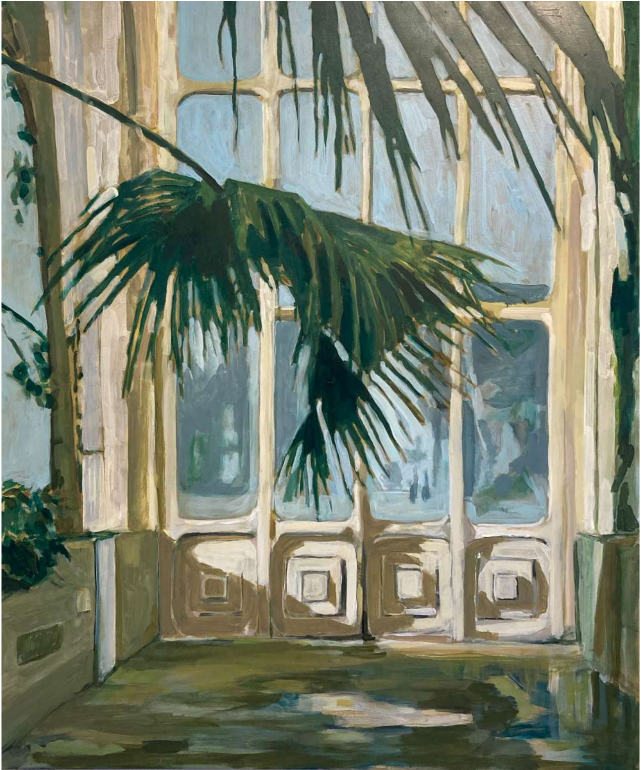
Untitled, 2024 Oil on wood panel, 90 x 75 cm