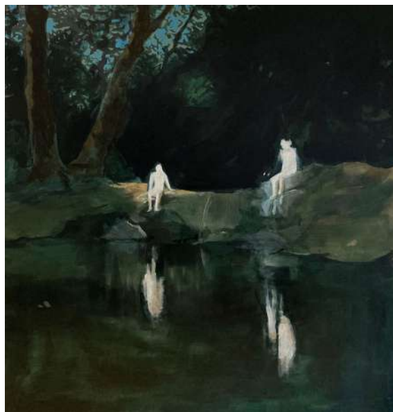
Untitled, 2023 Acrylic on wood panel, 136 x 129 cm

Yes, like most people, I started with what is most immediate — the figure. Even though I appreciate some ab-